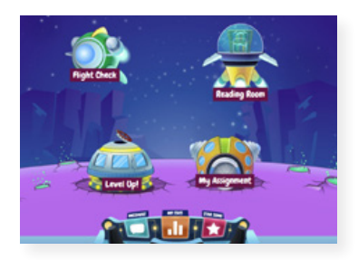
Get to know the Kids A-Z student portal.

All About Leveling > About Running Records